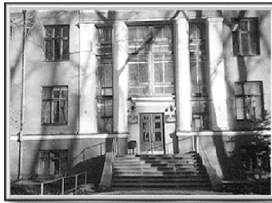
Figure 1: Sample PNG figure

Figures 1,2 show how to include a PNG/EPS figure. The source of the figure is in file building.png , example.eps .